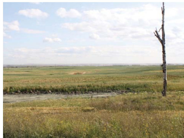
SUNCOR'S POND 1 WAS AN ACTIVE TAILINGS POND FROM 1967 TO 1997. TODAY, IT IS THE FIRST TAILINGS POND TO COMPLETE SURFACE RECLAMATION AND IS NOW CALLED WAPISIW LOOKOUT.